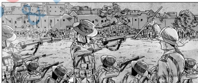
Tears of Blood: When 1,650 Bullets Changed India Forever

Look at the given picture and answer the questions that follow: